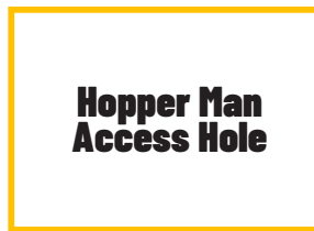
Hopper Man Access Hole