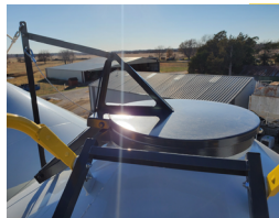
22" Ground Operated Top Door