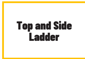
Top and Side Ladder